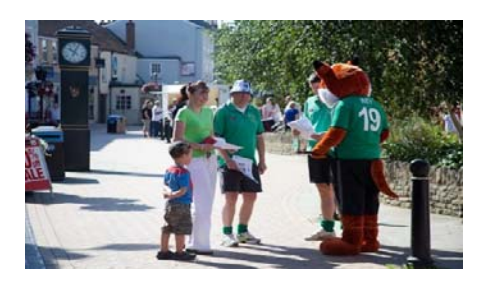
Talk to your public!